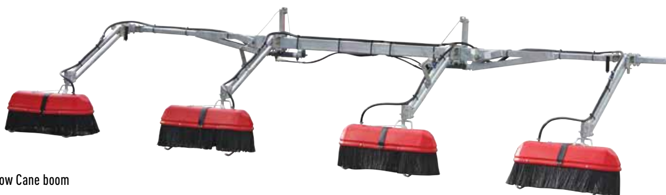
4 Row Cane boom

Note: Not all options will fit all models. Extra charges may apply to fitment of some options.